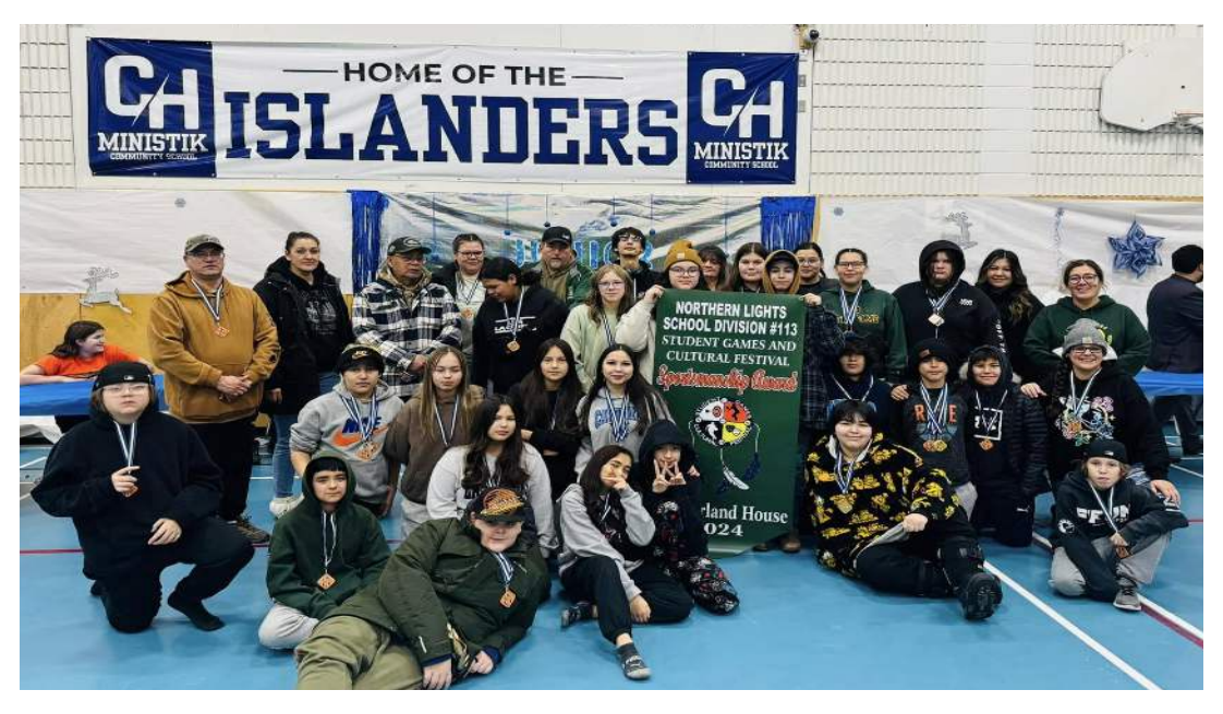
Our team came home with the sportsmanship award.