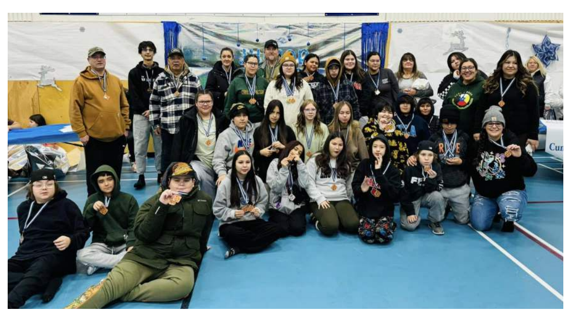
Our team came home with an overall bronze medal.