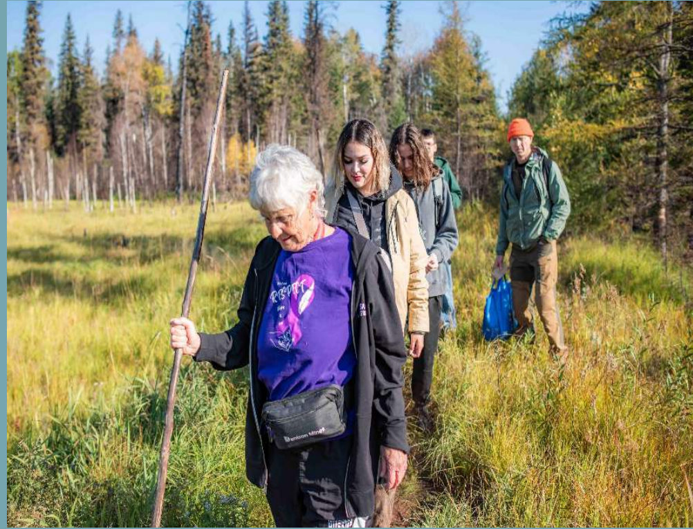
RHS staff and students learn together on the Land with Knowledge Keeper guidance.